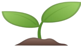
Sparkling Sprouts May News

The month of May is filled with the sounds of birds, the smell of fresh flowers and summer breezes. We are so excited that May is finally here. The children have been enjoying the spring days that allow us to play outside time to time. The month marks the end of spring and the beginning of summer.