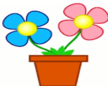
May News from the Toddling Turtles